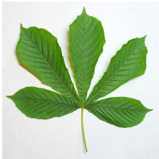
Horse Chestnut Leaf