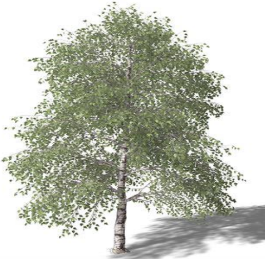
Silver Birch Tree