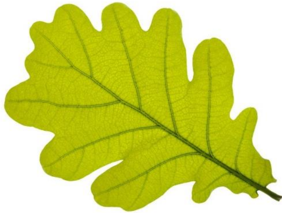
Oak Tree leaf