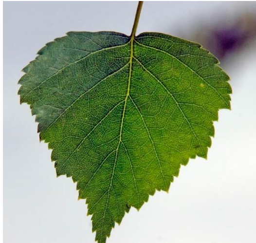
Silver Birch Leaf