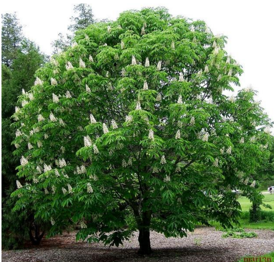
Horse Chestnut Tree (conker)